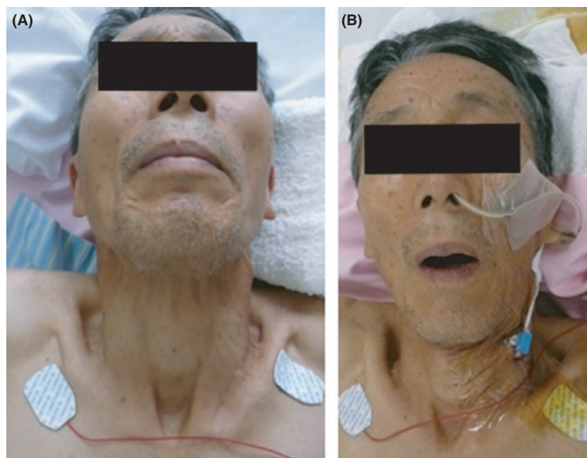
Fig. 1. Facial appearance of a 74-year-old man with tetanus. A, Facial appearance on arrival at hospital; trismus, contraction of the sternocleidomastoid, and stiffness in the neck are observed in the upper body. B, Appearance of the face 30 min after Kampo extracts were given. The painful contracture of the neck and trismus were improved 30 min after 7.5 g kakkonto and 7.5 g shakuyakukanzoto were given simultaneously.

nasogastric tube to release muscle tension. One to three packages of each Kampo extract was dissolved in tap water (20 mL). Trismus and generalized convulsions were temporarily improved 30 min after treatment with KT and SKT (Fig. 1B). Fluctuation of systolic blood pressure (100–170 mmHg) was observed for the first 3 days of hospitalization. It was most severe on day 1 (70–180 mmHg). On day 3 of hospitalization, mechanical ventilation was introduced to treat the complications of pneumonia. Blood gas analysis revealed pH 7.47, PaO 2 87 mmHg, PaCO 2 41 mmHg, base excess (BE) 5.6 mEq/L (F I O 2 0.6, synchronized intermittent mandatory ventilator (SIMV) 13/min, pressure control (PC) 10 cmH 2 O, pressure support (PS) 8 cmH 2 O, positive end-expiratory pressure (PEEP) 4 cmH 2 O). After 11 days of hospitalization, doses of KT and SKT were reduced to 5.0 g/day, as the tetanic convulsions were controlled without the use of muscle relaxants. After 17 days of hospitalization, the patient was weaned from the ventilator. The patient was discharged from the intensive care unit after 25 days; after 27 days, treatment with all Kampo medicines was terminated. After 30 days of hospitalization, he was discharged from the hospital without sequelae.