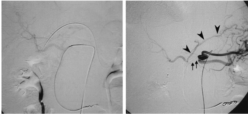
Fig. 2 A 56-year-old woman with metastatic liver tumors of pancreatic cancer. Left: The infusion catheter was positioned into the right gastroepiploic artery without fixation. The side hole of the catheter was opened at the level of the distal site of the common hepatic artery. Angiography through the infusion catheter showed good perfusion of bilateral hepatic lobes. Right: Four hundred thirty-six days after placement of the port-catheter system, the infusion catheter was dislodged by over 2.0 cm from the right gastroepiploic artery and the side hole of the catheter was in the celiac trunk. Angiography through the infusion catheter showed the occlusion of the common hepatic artery (arrow) and the left hepatic artery through left gastric artery (arrow head).

lodgement of over 2.0 cm from the target arteries in three patients with a mean system use of 384 days (range 358–436 days). One patient was given a new infusion catheter. In two of three cases the PCS was removed because of occlusion of the common hepatic artery.